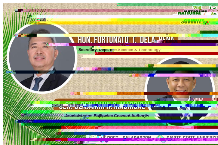
Guests of honor for the summit

A total of 220 stakeholders participated in the said summit, conducted via Zoom and streamed live on Facebook. Participants were composed of makapuno farmers and processors, state universities and colleges and other private higher education institutions, national government agencies, non-government organizations, local government units and other interested private